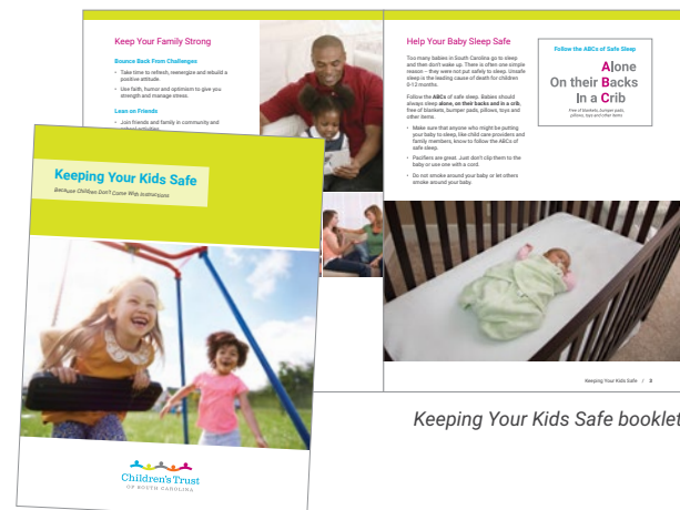
Keeping Your Kids Safe booklet

All parents want to keep their kids safe but don't always know where to start or what to do. Children's Trust has compiled important parenting information and put it into an easy-to-read booklet. Use it in your work and share it with the parents you serve.