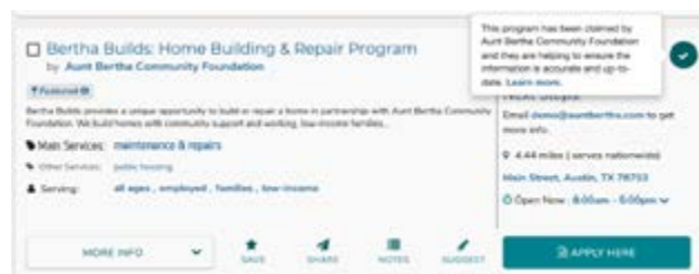
Findhelp program listing illustrating it has been claimed with a checkmark.