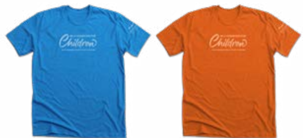
Sample blue and orange shirts with tone on tone imprint colors.

Please note: The "Be a Champion for Children with Children's Trust of South Carolina" graphic should be printed on the front of the shirt by itself, and all other organization or sponsor logos should go on the back or a sleeve of the t-shirt. Use any color shirt you prefer to match your brand colors for the design.