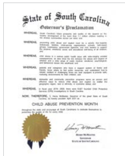
An example of a proclamation from the Governor.

To help us coordinate and track proclamations, please submit the brief form on scChildren.org/capmonth . We will then share the news on our social channels and website.