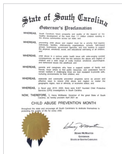
An example of a proclamation from the Governor.

To help us coordinate and track proclamations, please submit the brief form on scChildren.org/capmonth . We will then share the news on our social channels and website.