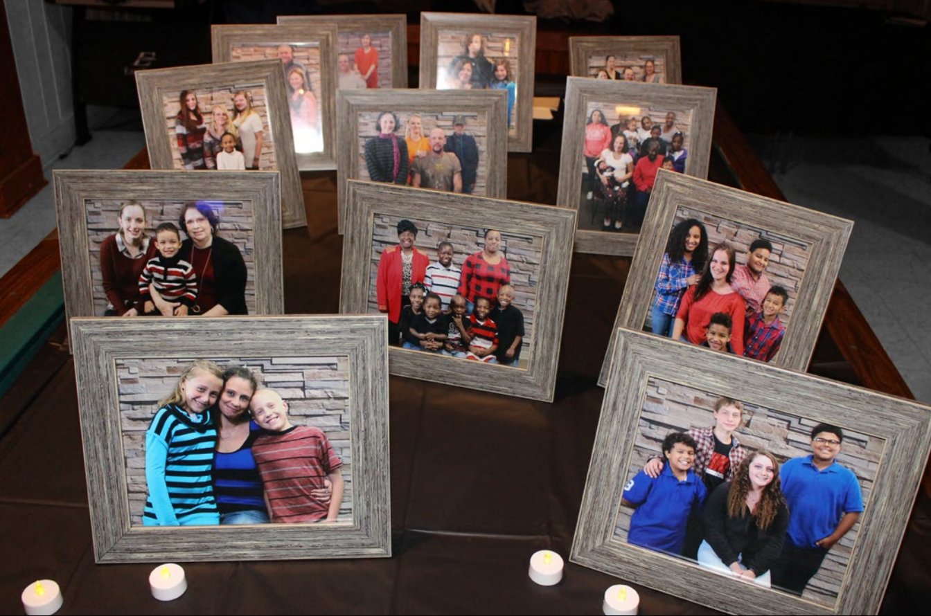
Family portraits were given as gifts during the Strengthening Families Program graduation at Thornwell Home for Children.