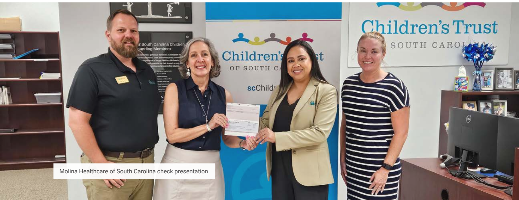
Molina Healthcare of South Carolina check presentation