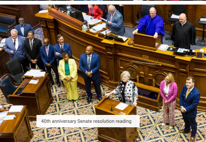
40th anniversary Senate resolution reading