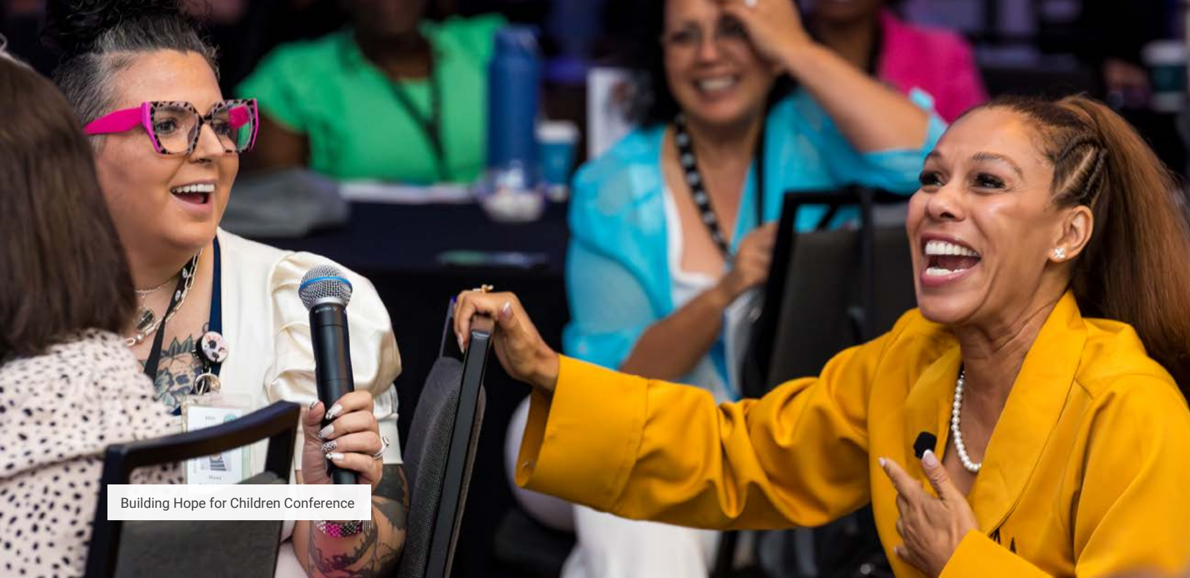
Building Hope for Children Conference