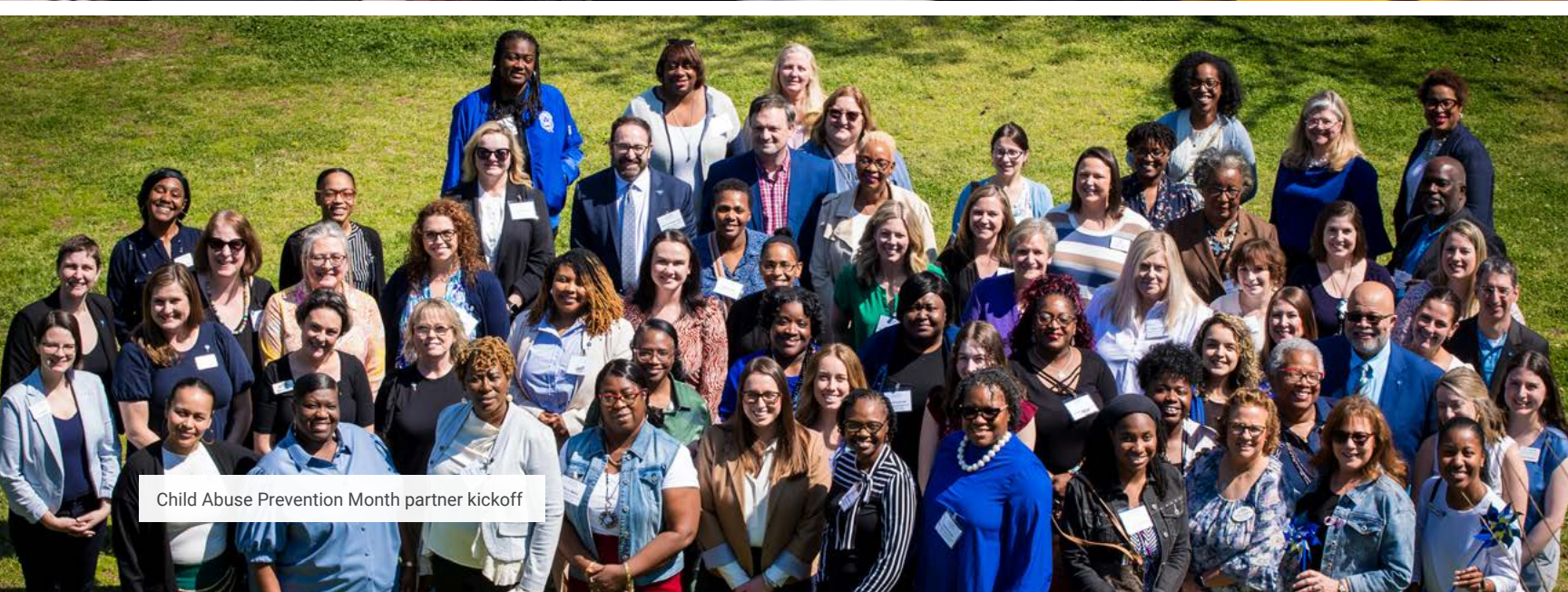
Child Abuse Prevention Month partner kickoff